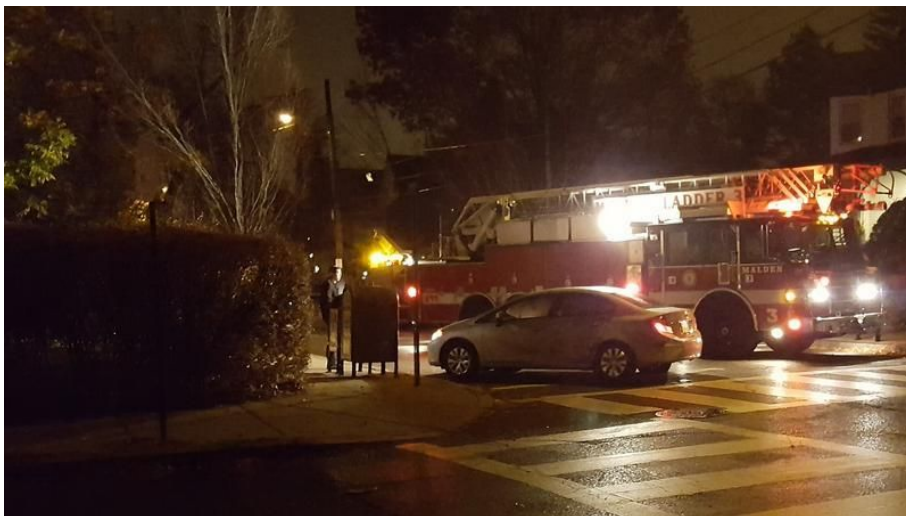
November 19, 2016 two-car accident

Vehicle accidents seem to occur when one vehicle is on Clifton and one vehicle is on Dexter and they mis-time entry into the shared roadway (possibly because one vehicle has stopped before proceeding and the other is expected to stop but does not.)