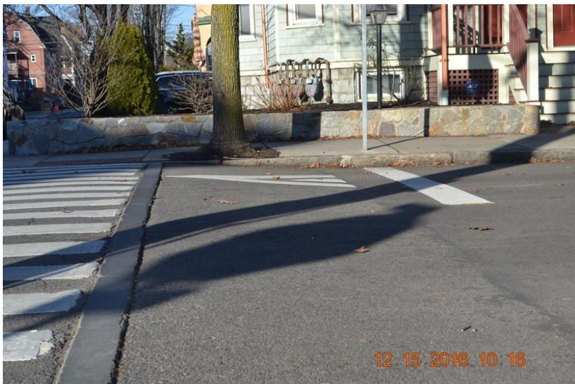
Raised Crosswalk, Somerville, MA