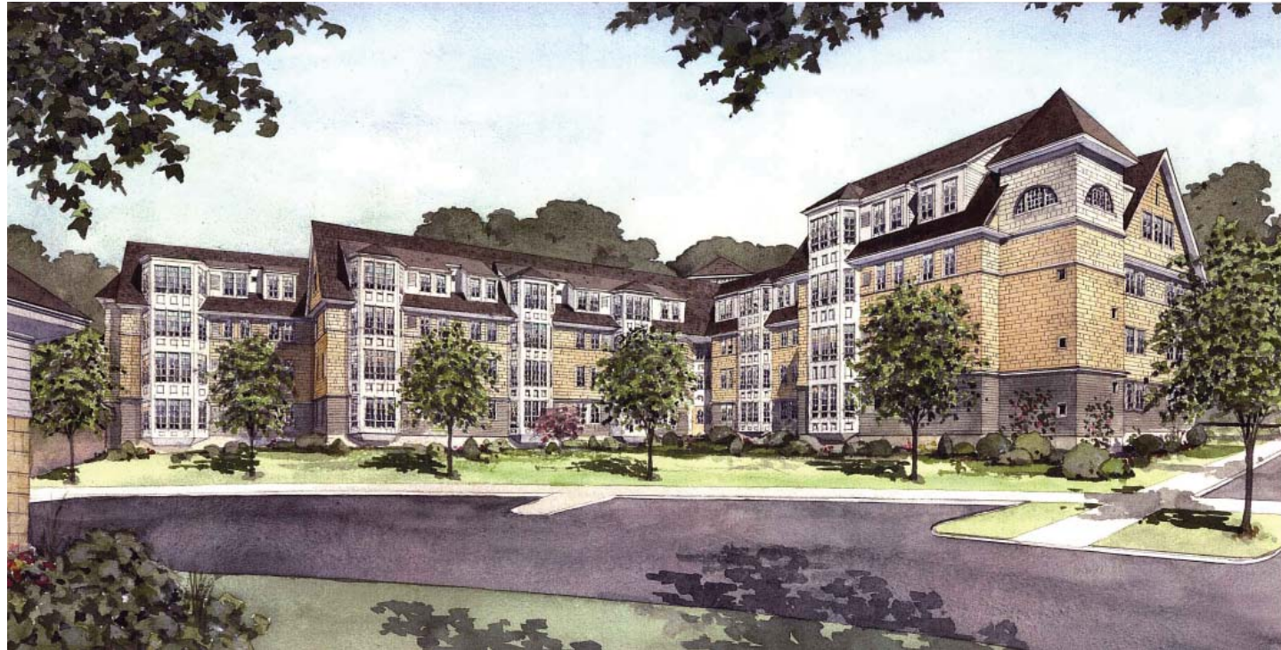
Exterior Building Rendering*

FORMER MALDEN MEDICAL CAMPUS, MALDEN/MEDFORD, MA